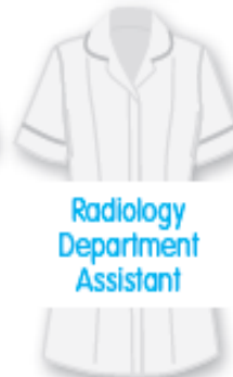
Radiology Department Assistant