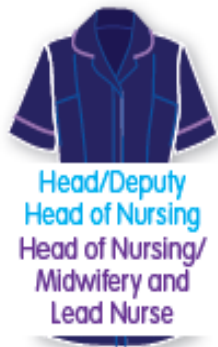
Head/Deputy Head of Nursing Head of Nursing/ Midwifery and Lead Nurse