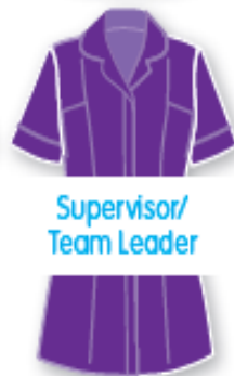
Supervisor/ Team Leader