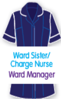
Ward Sister/ Charge Nurse Ward Manager