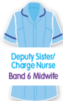
Deputy Sister/ Charge Nurse Band 6 Midwife