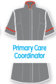
Primary Care Coordinator