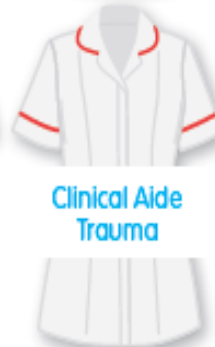
Clinical Aide Trauma