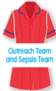
Outreach Team and Sepsis Team