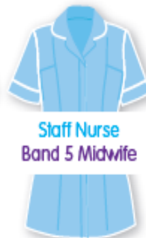
Staff Nurse Band 5 Midwife