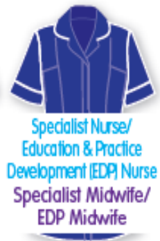
Specialist Nurse/ Education & Practice Development (EDP) Nurse Specialist Midwife/ EDP Midwife