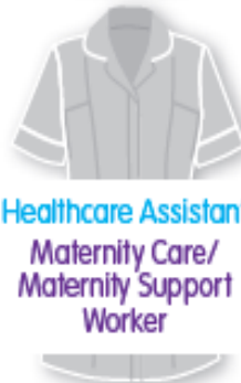
Healthcare Assistant Maternity Care/ Maternity Support Worker