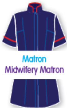
Matron Midwifery Matron