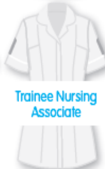
Trainee Nursing Associate