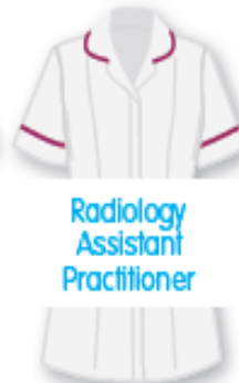
Radiology Assistant Practitioner